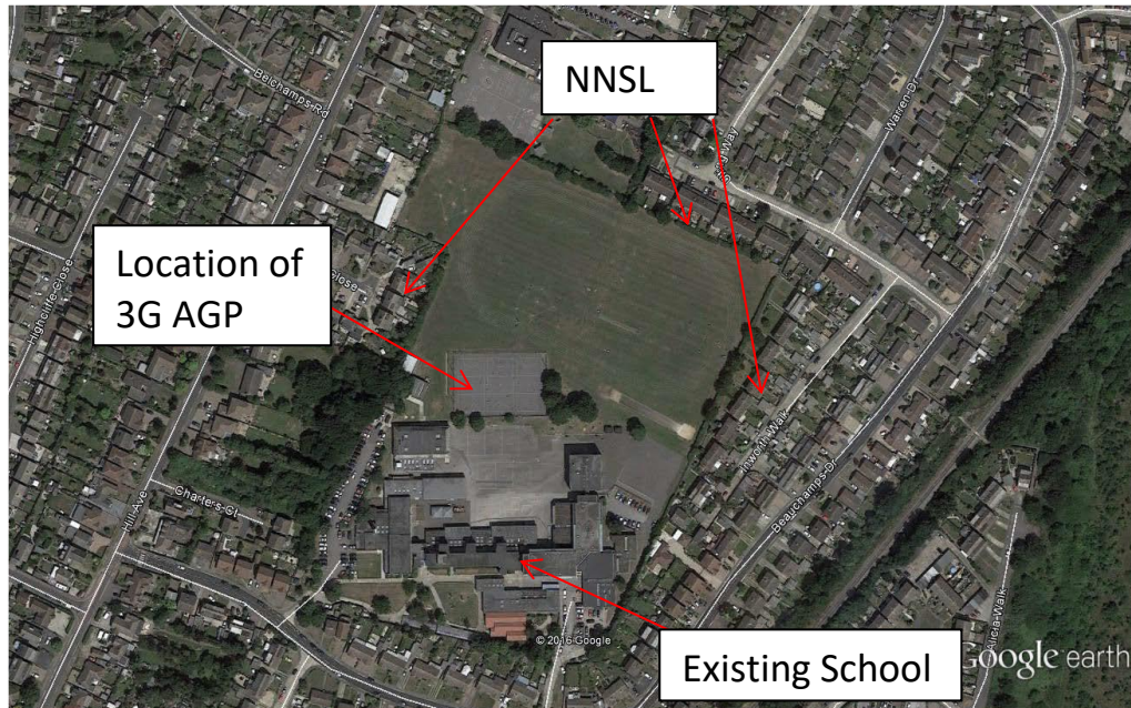
Figure 1: 3G Artificial Grass Pitch and Nearest Noise Sensitive Location

4.1 The site location and NNSL identified are shown in Figure 1.